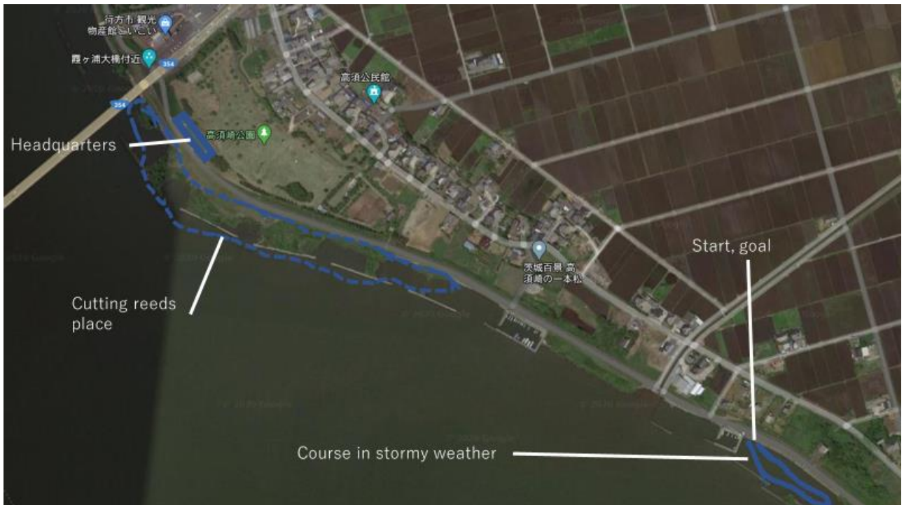
Map Competition course in stormy weather